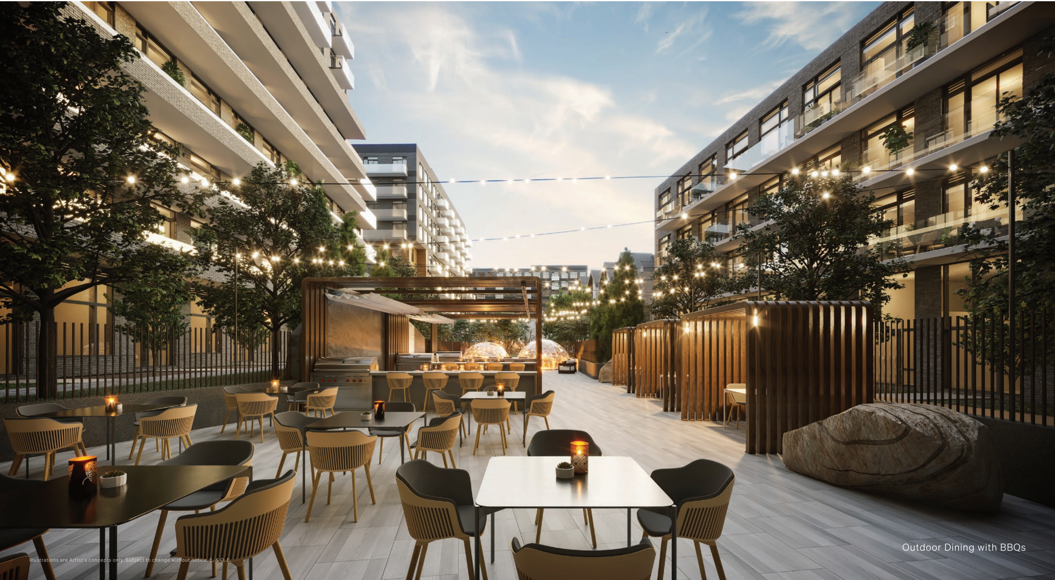
Outdoor Dining with BBQs

An expansive wood-hued terrace with a cozy fireplace, barbecues, private cabanas, and lots of tables and chairs makes it easy to spend as much of the warmer months outside as you like. In winter, the fireplace entices with its warm glow.