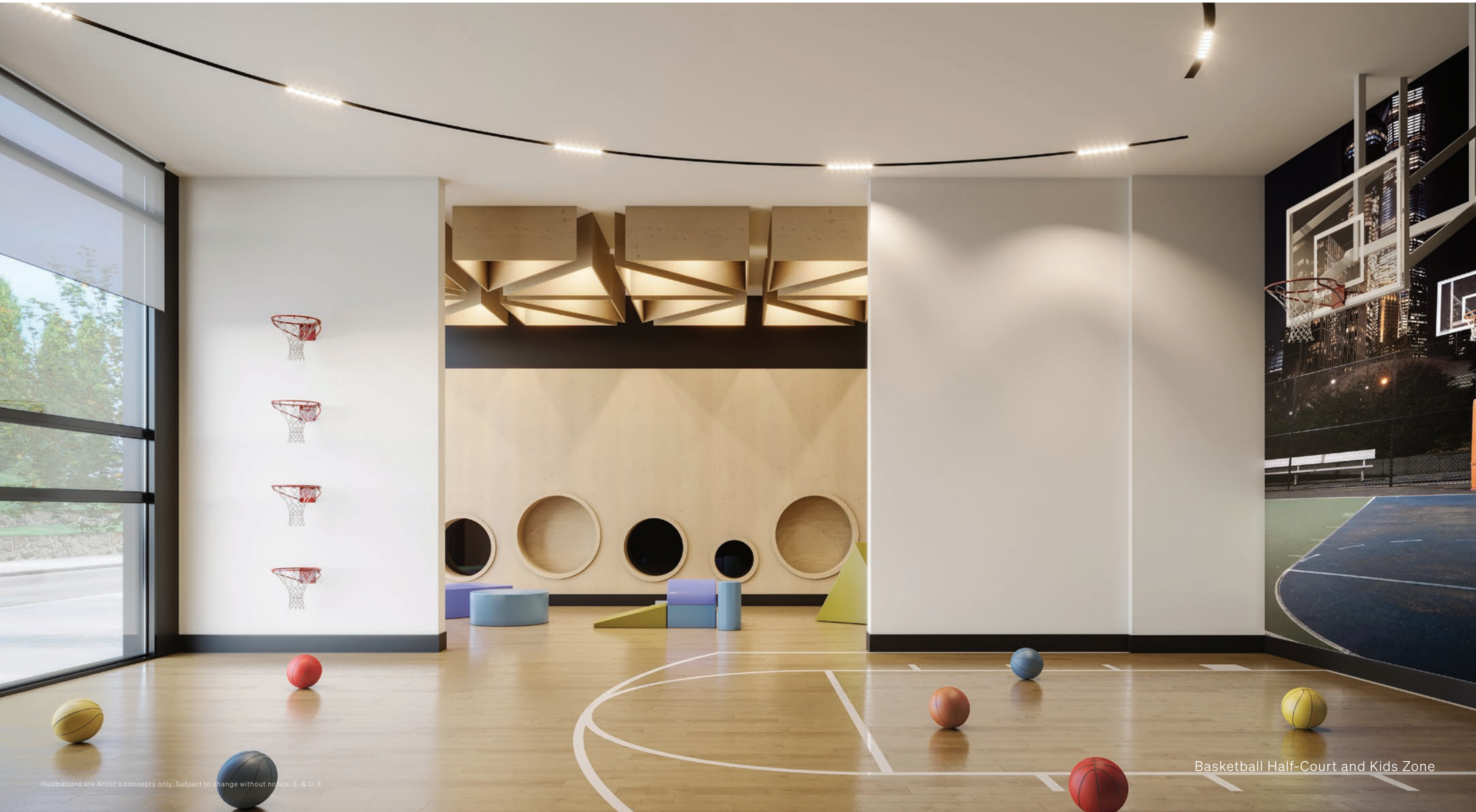
Basketball Half-Court and Kids Zone

Aspiring Raptors players or kids just looking to have fun at their favourite games will be thrilled to find a fully equipped gym with basketball half-court and practice baskets; an adjoining play space gives younger kids a place to explore and make new friends. In addition, the expansive fitness centre and relaxing spa with sauna make it effortless to work towards your health and fitness goals.