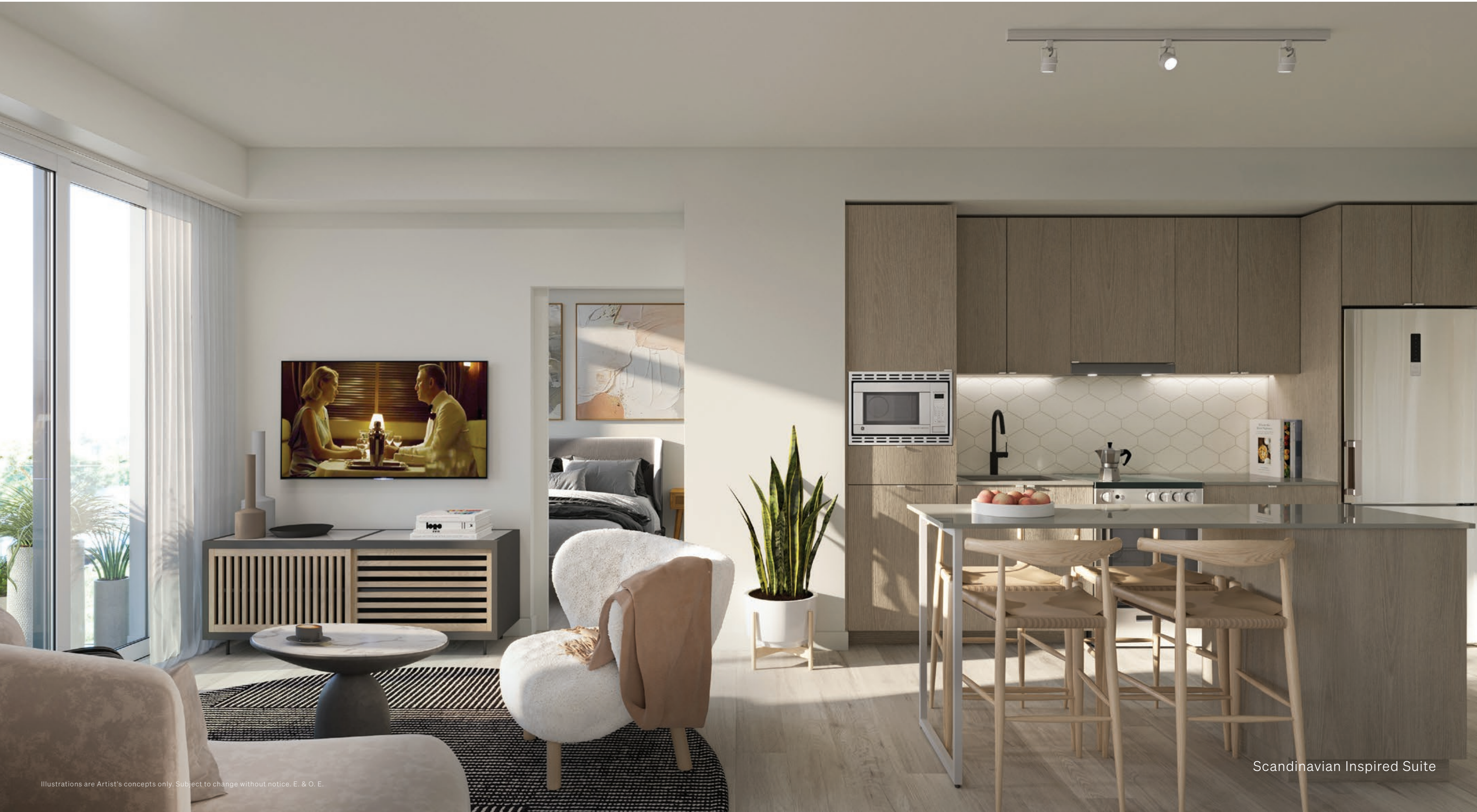
Scandinavian Inspired Suite

A relaxing retreat and the hub of your home life, the living area is as space-efficient as it is serene. With smart thermostats working for you for seamless comfort, you can always control your home's temperature from anywhere. Your modern kitchen/dining area is designed to enhance your culinary experience, whether you're entertaining guests or putting together a quick meal.